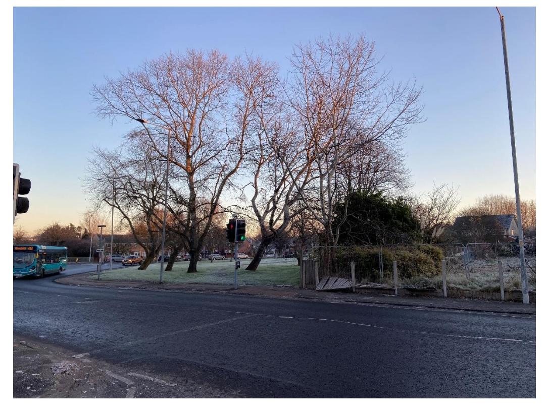
Figure 2 Council land (left) and former Fire Station site (Right): taken from Arroe Park Road, facing East.