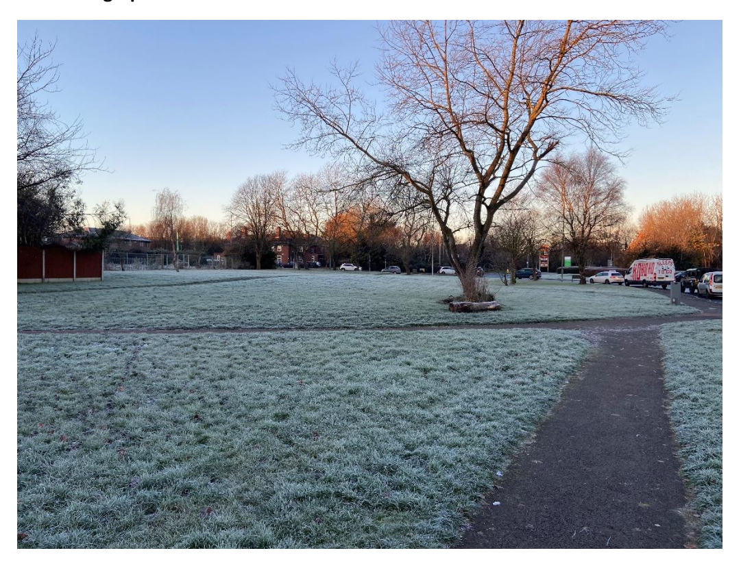
Figure 1Council land. Image taken on Upton Road Facing West.